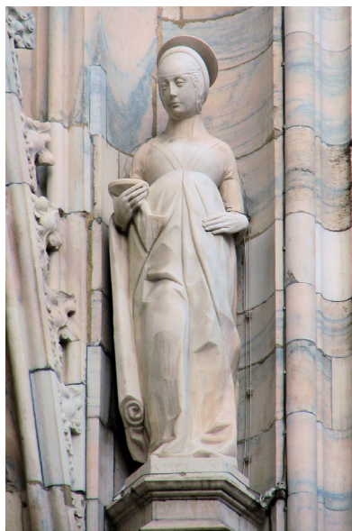
Santa Lucia, c. 1380s C.E. Duomo di Milano, Milano